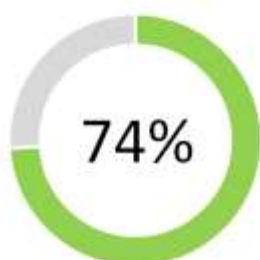
Figure 4: FIS' scores on the four SGO dimensions